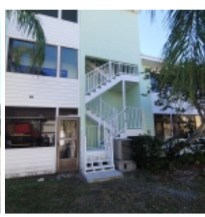
BUILDING X Units 33 - 46